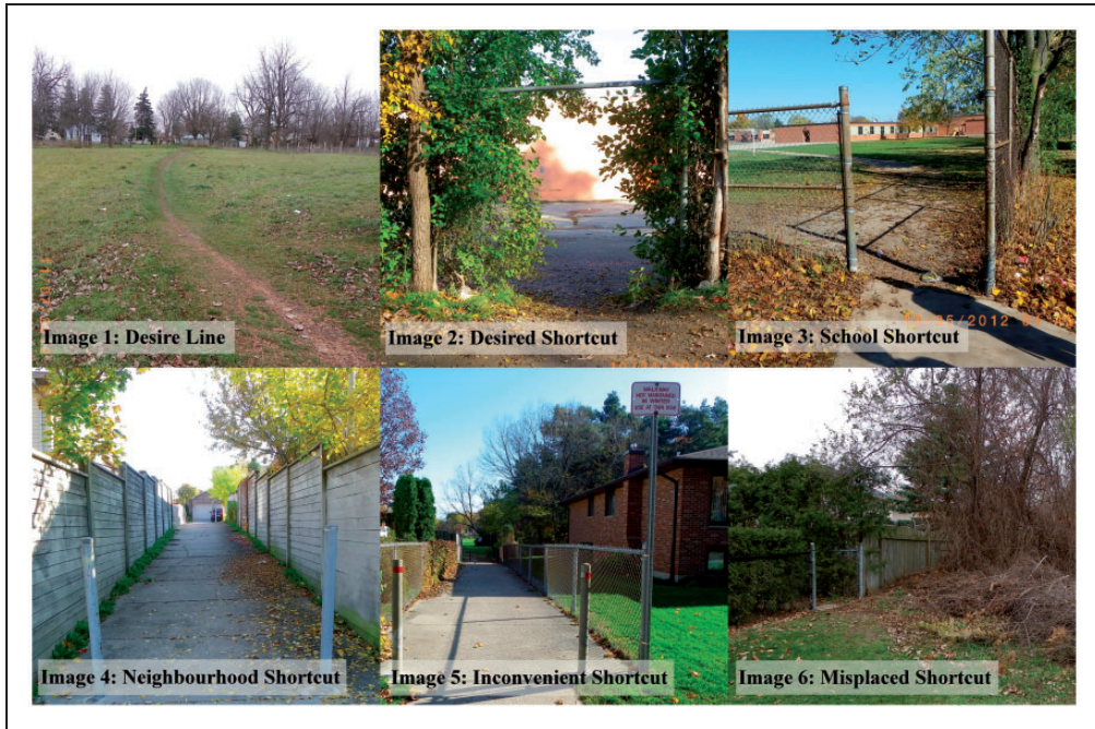
Figure 2. Examples of shortcuts found during walkabouts in London, Canada.

School by school comparison. The next analysis determines the schools that have significantly shorter distances to AST due to the existence of shortcuts. Since each school is influenced differently by shortcuts, this analysis will determine how distance (500- and 1000-m home locations) and the school environments can influence the distance saved. Tables 2 and 3 show the results of a paired t -test analysis for each individual school.