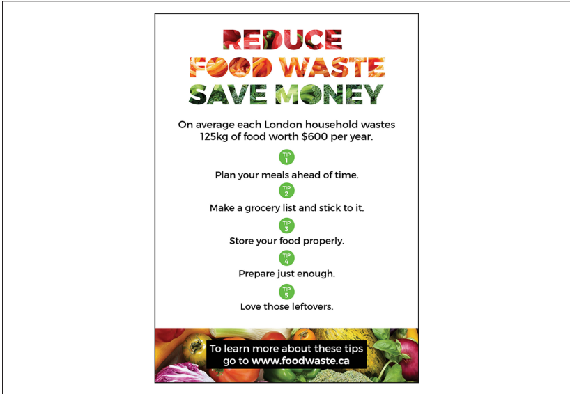
Figure 2. Postcard/fridge magnet included in intervention package.

not alerted to the specific day of the collection of these samples. Sample (i.e., bags of garbage) collection started at 7:00 a.m. in the morning and concluded by 8:30 a.m. each day. Samples were labeled, per household address, so that they could be identified after unloading. The number of recycling containers set out at the curb, by household, was also counted.